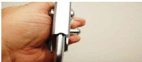
Figure 1: Loose rivet may protrude from hook.

We want to remind users to conduct a pre-use inspection of all fall protection safety equipment prior to use as per instructions in the user manuals. If a missing or incompletely installed rivet is identified in a snaphook on a Capital Safety product, the product should be removed from service, tagged with a defective tag and returned to Tool Facility at the SFC for collection. They will then be sent for replacement under warranty. (See figure 1 & 2 below.)