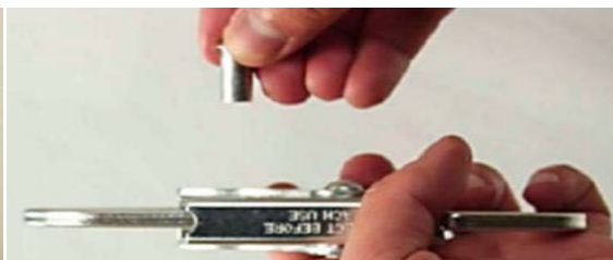
Figure 2: Loose rivet can separate from hook

Questions or concerns: Please contact your local safety professional or a member of the Electric Utilities Tool and Equipment Committee.